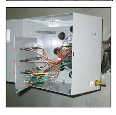
Iris Power Stator Slot Coupler, Iris Power TGA-S and Iris Power TurboGuardII are trademarks of Qualitrol-Iris Power.

QUALITROL-IRIS POWER HAS BEEN THE WORLD LEADER IN MOTOR AND GENERATOR WINDING DIAGNOSTICS SINCE 1990, PROVIDING A FULL LINE OF ON-LINE AND OFF-LINE TOOLS, AS WELL AS COMMISSIONING AND CONSULTING SERVICES.